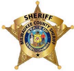
David A. Clarke, Jr., Sheriff Milwaukee County Sheriff's Office